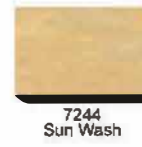
7244 Sun Wash