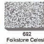
692 Folkstone Celesta *Available in Class A*