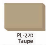
PL-220 Taupe *Available in Antimicrobial*