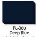
PL-300 Deep Blue *Available in Class A and Antimicrobial*