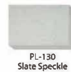
PL-130 Slate Speckle