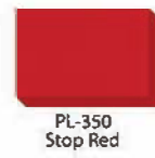
PL-350 Stop Red