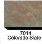
7014 Colorado Slate