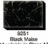
9251 Black Maise *Available in Class A*