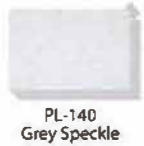
PL-140 Grey Speckle