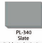
PL-340 Slate *Available in Antimicrobial*