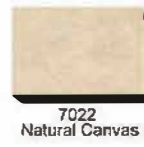
7022 Natural Canvas