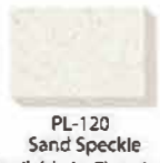
PL-120 Sand Speckle *Available in Class A and Antimicrobial*