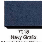
7018 Navy Grafix *Available in Class A*