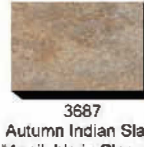
3687 Autumn Indian Slate *Available in Class A*