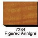
7284 Figured Annigre

20 Year Warranty Graffiti Proof Material Non-Absorbent Class A and B Fire Rating Unaffected by humidity or corrosive environments Scratch Resistant Number Plates