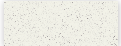
PL-120 Sand Speckle