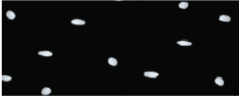
PL-280 Black Paisley*

Color matching is limited by printing process. Actual samples available and recommended prior to color selections.