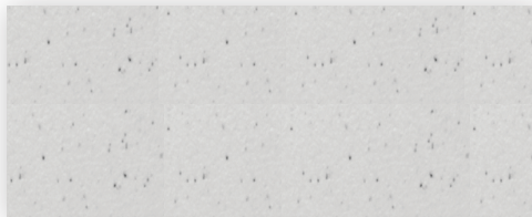
PL-130 Slate Speckle